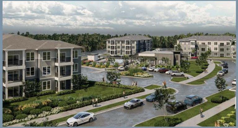
Perimeter Pointe Charlotte, NC

DRP closed on The Exchange in March of 2023. The community will add 252 apartment and townhome luxury residential units to the Exchange Business Park located on 15.8 acres directly off I-77 and Tyvola Road in Charlotte, NC. Vertical construction is well underway with first units targeted for Q4 of 2024.