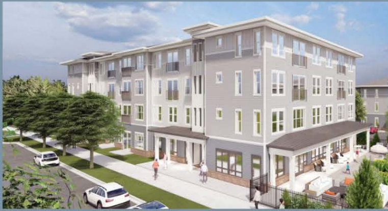
The Exchange Charlotte, NC

DRP closed on The Exchange in March of 2023. The community will add 252 apartment and townhome luxury residential units to the Exchange Business Park located on 15.8 acres directly off I-77 and Tyvola Road in Charlotte, NC. Vertical construction is well underway with first units targeted for Q4 of 2024.