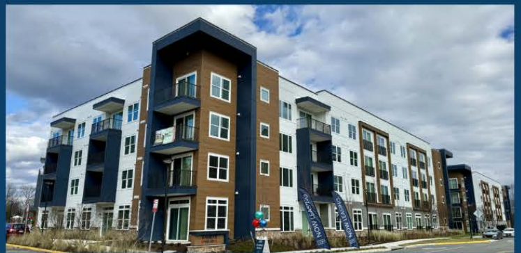
Adams Hill Greenville, SC

Construction came to a close in 2023 on Boulders Lakeview, a 212-unit luxury apartment development in Richmond, VA. Boulders Lakeview is 98% leased and represents DRPs 2nd development in the Boulders Park totaling a combined 460 units.