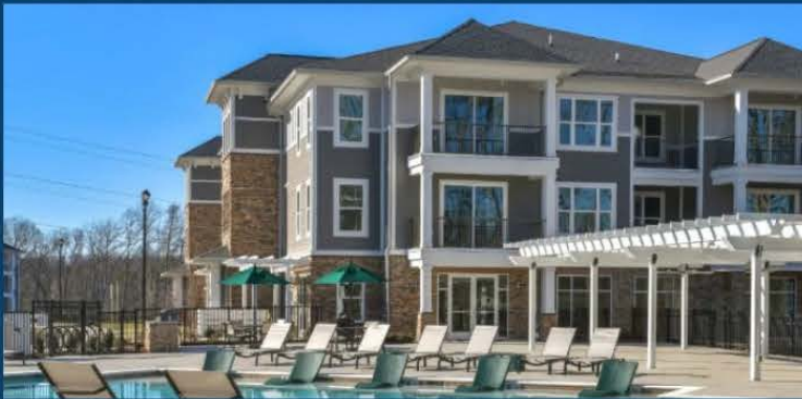
Innsbrook Square Richmond, VA

Located in the Innsbrook Corporate Centre, Innsbrook Apartments opened for leasing in late 2023. The 305-unit apartment community is located adjacent to 58 for sale townhome lots that DRP developed and sold to HHHunt.